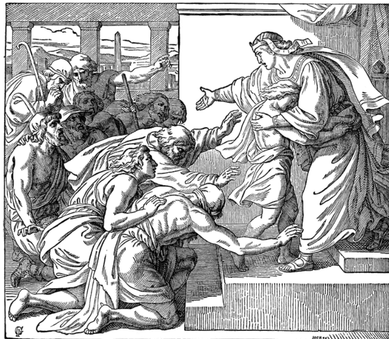
Joseph Makes Himself Known to His Brothers. Artist unknown. Etching

Joseph said to his brothers, "I am Joseph. Is my father still alive?" But his brothers could not answer him, so dismayed were they at his presence. Then Joseph said to his brothers, "Come closer to me." And they came closer. He said, "I am your brother, Joseph, whom you sold into Egypt. And now do not be distressed, or angry with yourselves, because you sold me here; for God sent me before you to preserve life. For the famine has been in the land these two years; and there are five more years in which there will be neither plowing nor harvest. God sent me before you to preserve for you a remnant on earth, and to keep alive for you many survivors. So it was not you who sent me here, but God; he has made me a father to Pharaoh, and lord of all his house and ruler over all the land of Egypt. Hurry and go up to my father and say to him, "Thus says your son Joseph, God has made me lord of all Egypt; come down to me, do not delay. You shall settle in the land of Goshen, and you shall be near me, you and your children and your children's children, as well as your flocks, your herds, and all that you have. I will provide for you there--since there are five more years of famine to come--so that you and your household, and all that you have, will not come to poverty." And he kissed all his brothers and wept upon them; and after that his brothers talked with him.