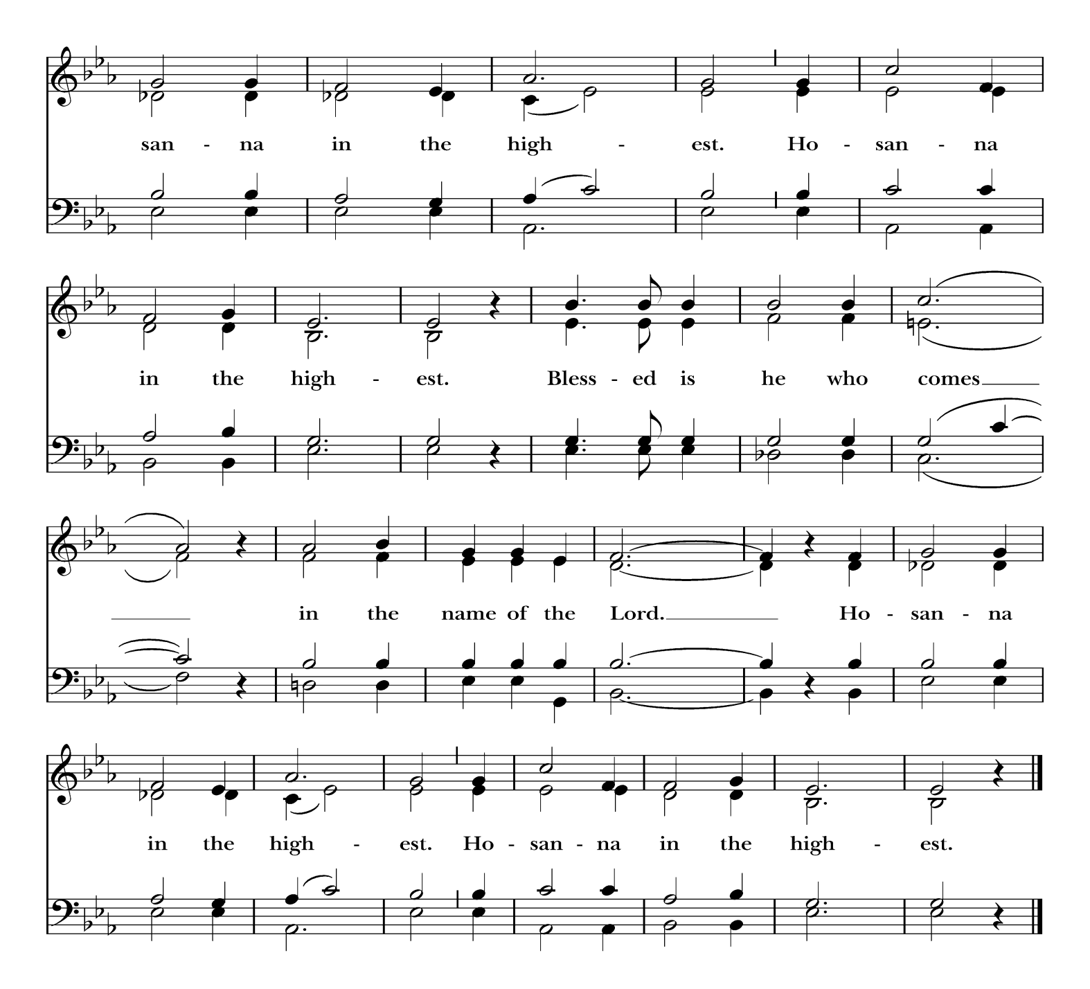
The people stand or kneel.