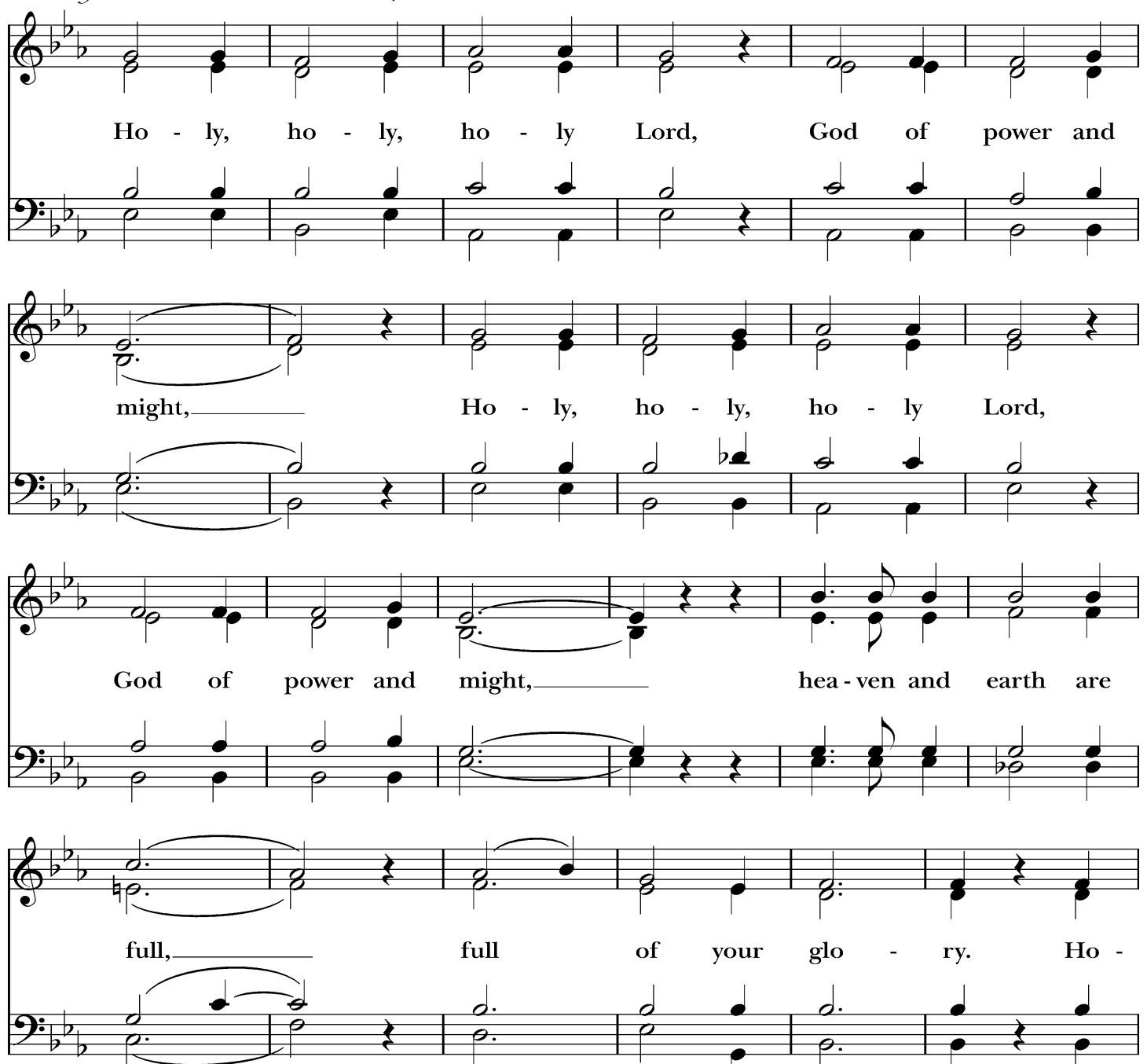
The Hymnal 1982, Service Music, #130

Therefore, we praise you, joining our voices with Angels and Archangels and with all the company of heaven, who for ever sing this hymn to proclaim the glory of your Name: