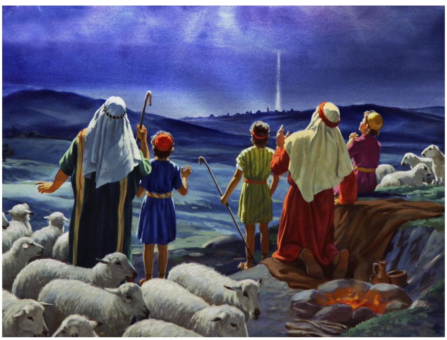
The Gospel Lesson