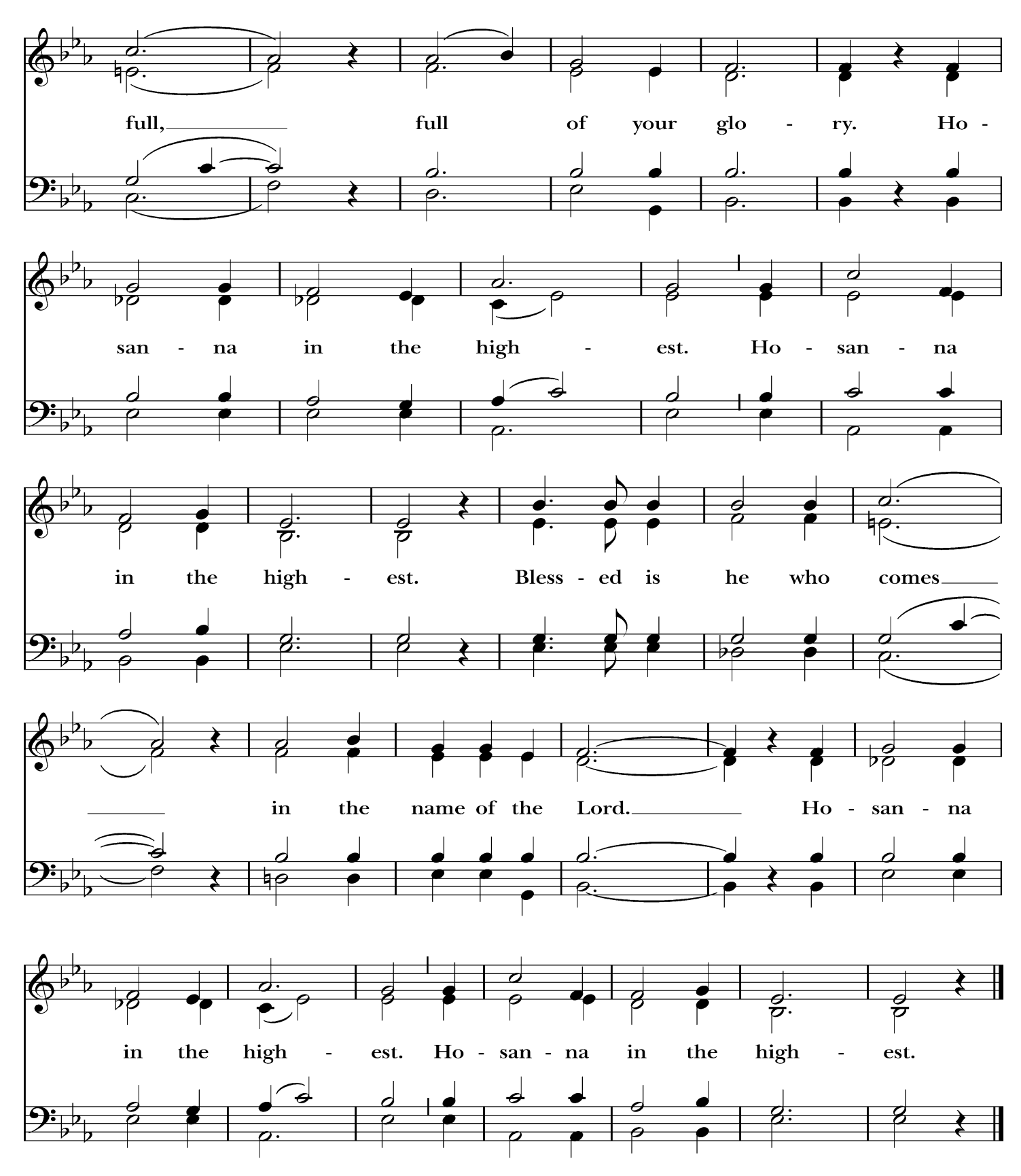
The people stand or kneel. Then the Celebrant continues