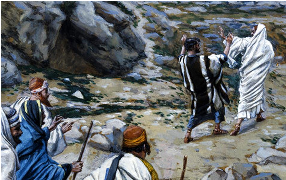
Get Thee Behind Me, Satan , by James Tissot. 19 th Century