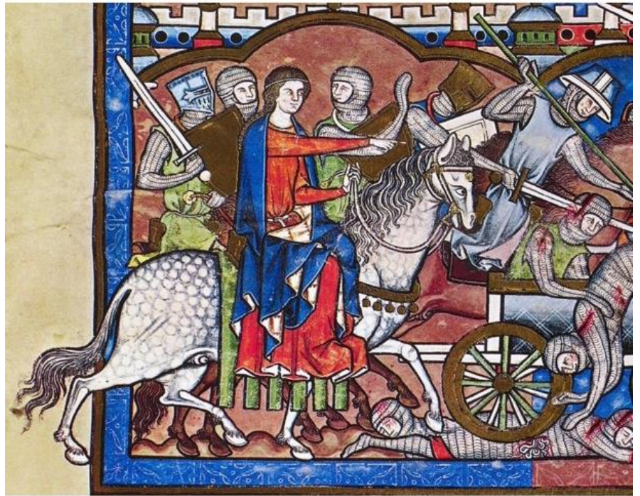
The Prophetess Deborah Encouraging Barak And His Knights To Attack The Army Of King Jabin Of Hazor. Detail from French illuminated manuscript. Circa 1300 AD

The Israelites again did what was evil in the sight of the Lord, after Ehud died. So the Lord sold them into the hand of King Jabin of Canaan, who reigned in Hazor; the commander of his army was Sisera, who lived in Harosheth-ha-goiim. Then the Israelites cried out to the Lord for help; for he had nine hundred chariots of iron, and had oppressed the Israelites cruelly twenty years.