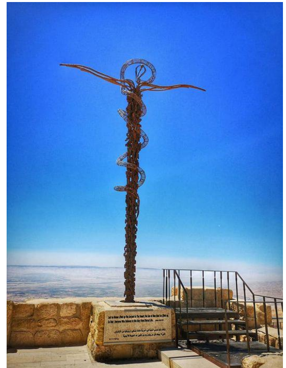
Monument to the Bronze Serpent on Mt. Nebo