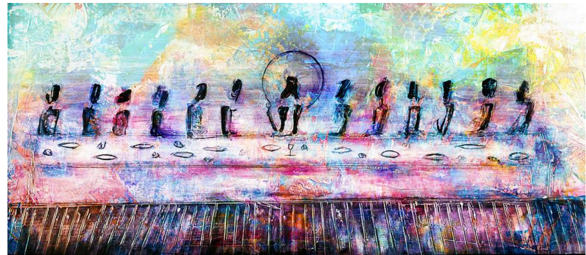
The Liturgy of the Holy Eucharist, sometimes called the Mass