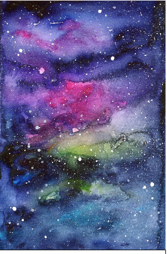
Rainbow Galaxy by Olga Shvartsur