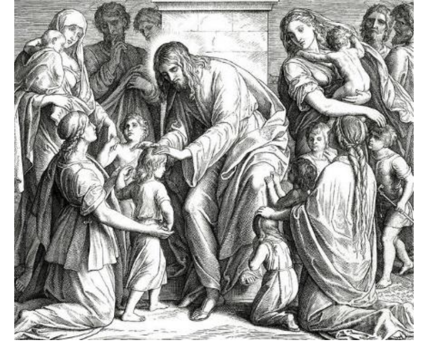
Jesus Christ Calls the Children to Him by Julius Schnorr Von Carolsfeld

last of all and servant of all." Then he took a little child and put it among them; and taking it in his arms, he said to them, "Whoever welcomes one such child in my name welcomes me, and whoever welcomes me welcomes not me but the one who sent me."