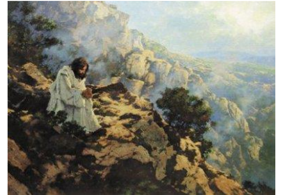
Christ in the Wilderness. Artist unknown.

Now after John was arrested, Jesus came to Galilee, proclaiming the good news of God, and saying, "The time is fulfilled, and the kingdom of God has come near; repent, and believe in the good news."