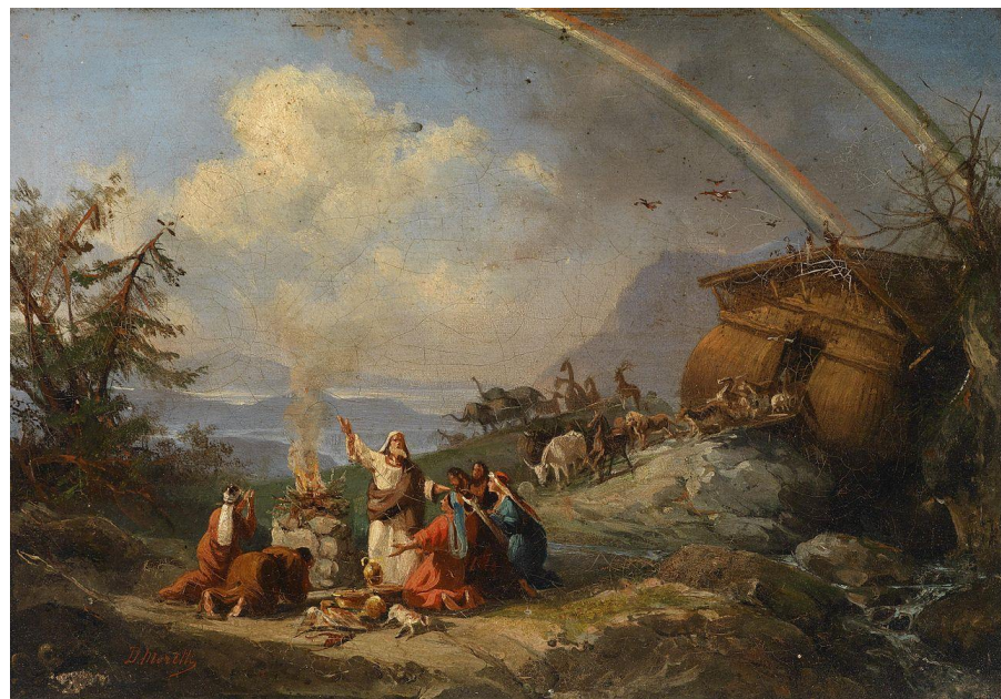
Noahs Dankgebet. Domenico Morelli, 19 th Century.

God said to Noah and to his sons with him, "As for me, I am establishing my covenant with you and your descendants after you, and with every living creature that is with you, the birds, the domestic animals, and every animal of the earth with you, as many as came out of the ark. I establish my covenant with you, that never again shall all flesh be cut off by the waters of a flood, and never again shall there be a flood to destroy the earth." God said, "This is the sign of the covenant that I make between me and you and every living creature that is with you, for all future generations: I have set my bow in the clouds, and it shall be a sign of the covenant between me and the earth. When I bring clouds over the earth and the bow is seen in the clouds, I will remember my covenant that is between me and you and every living creature of all flesh; and the waters shall never again become a flood to destroy all flesh. When the bow is in the clouds, I will see it and remember the everlasting covenant between God and every living creature of all flesh that is on the earth." God said to Noah, "This is the sign of the covenant that I have established between me and all flesh that is on the earth."