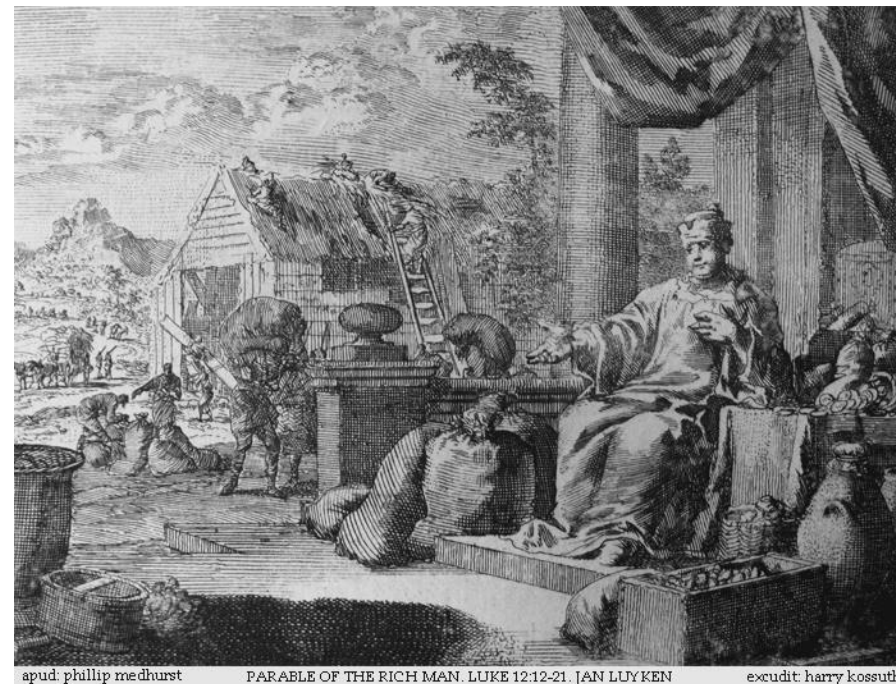
PARABLE OF THE RICH MAN. LUKE 12:12-21. JAN LUYKEN