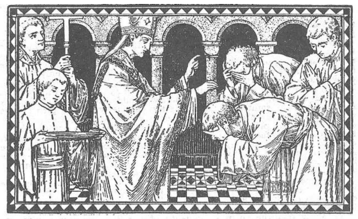
Remember, man, that thou art dust, and into dust thou shalt

Silence is then kept for a time, all kneeling.