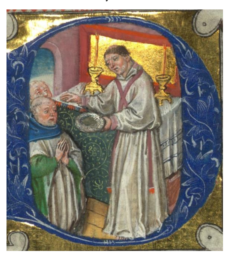
March 2, 2022

With the Imposition of Ashes and Holy Eucharist