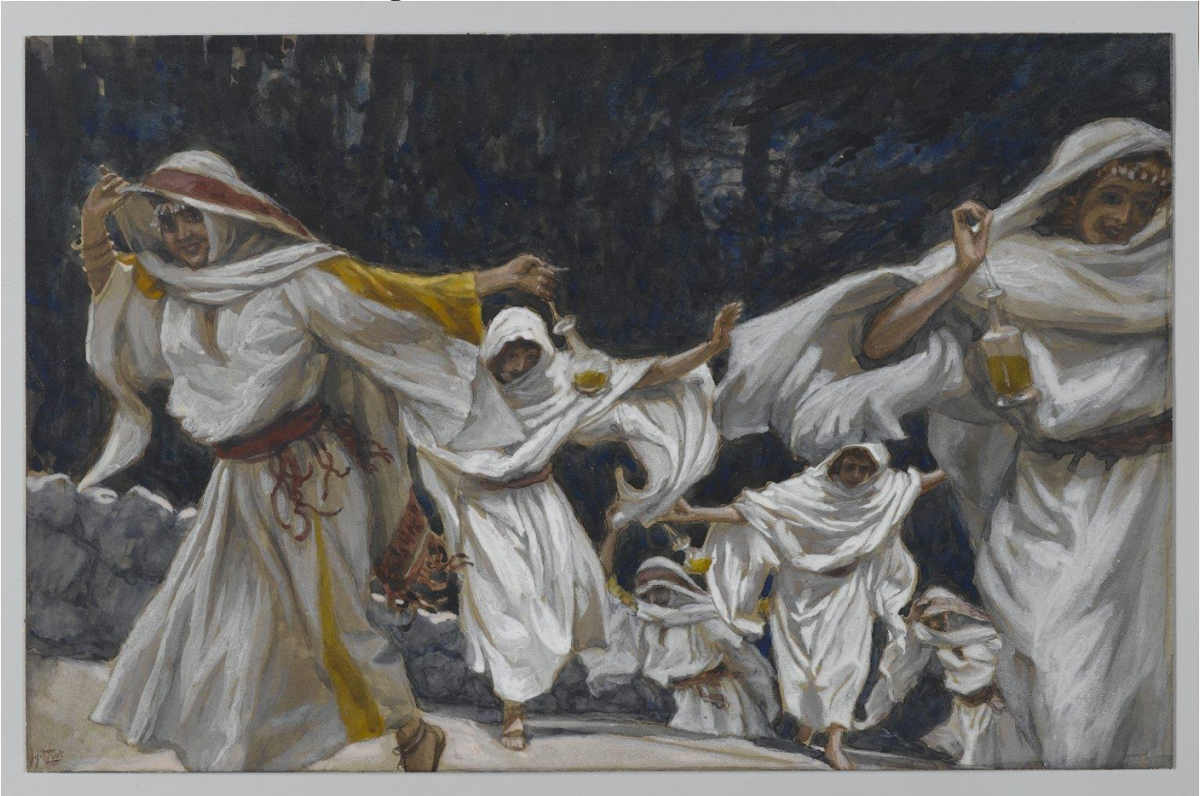
The Foolish Virgins, by James Tissot. 1894. Brooklyn Museum of Art.