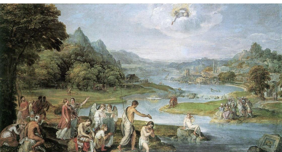
The Baptism of Christ by Lambert Sustris. Circa 1543