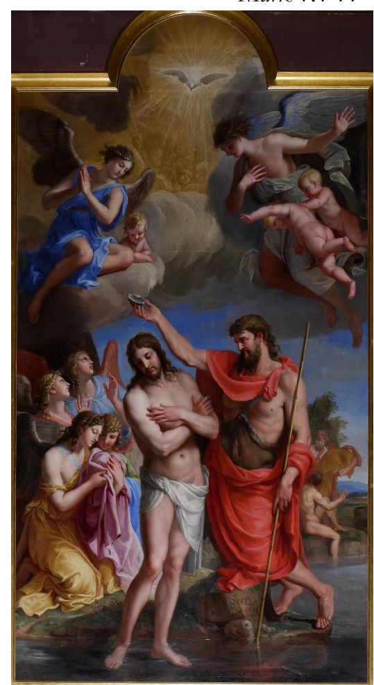
The Baptism of Christ by Jacques Stella. 17<sup>th</sup> century