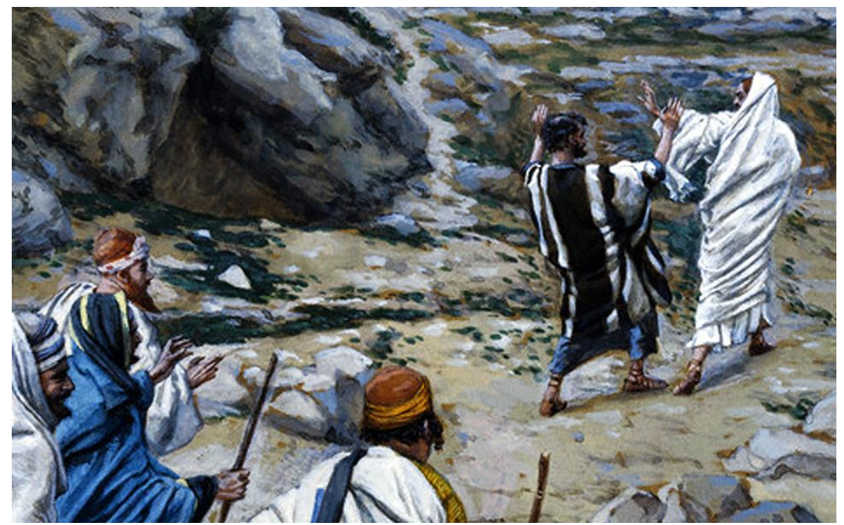
Get Thee Behind Me, Satan, by James Tissot. 19th Century