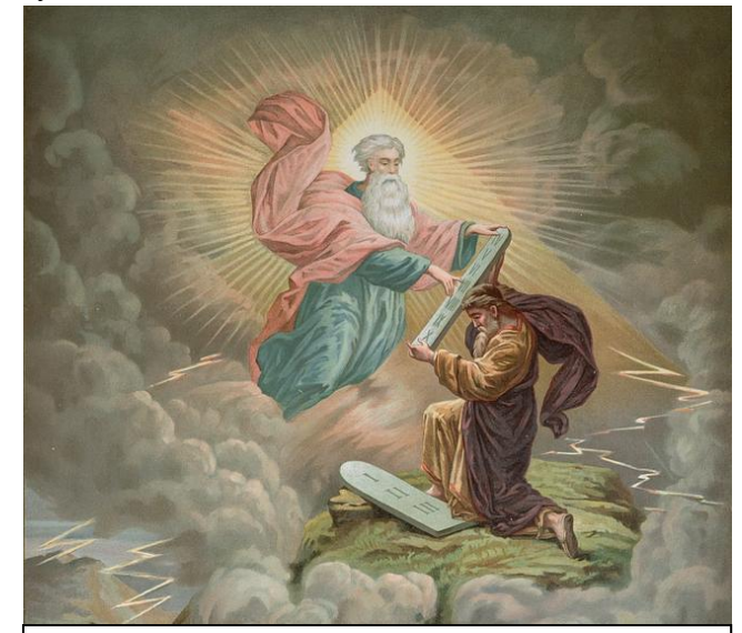
Moses Receives the Tablets of the Law from God on Mount Sinai, from the French School. 19th century.