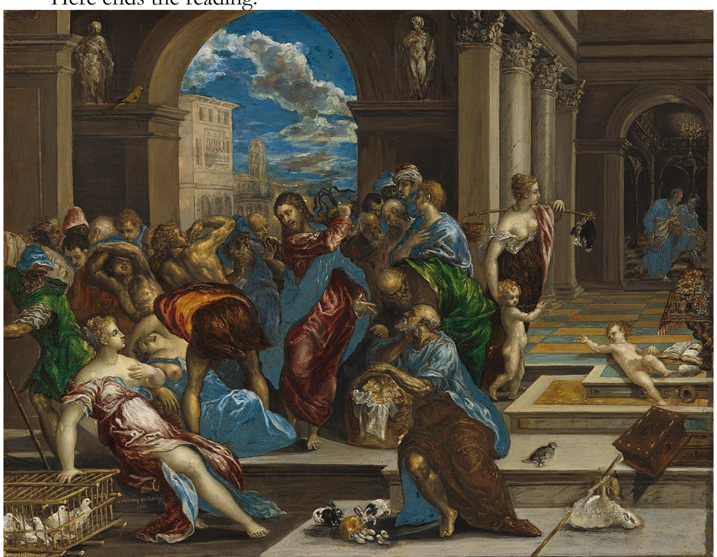
Christ Driving the Money Changers from the Temple, by El Greco. 17th Century