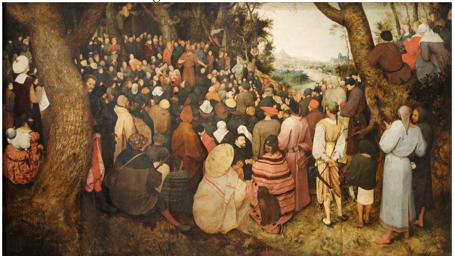
The Preaching of St. John the Baptist, by Pieter Brueghel the Elder, 1566