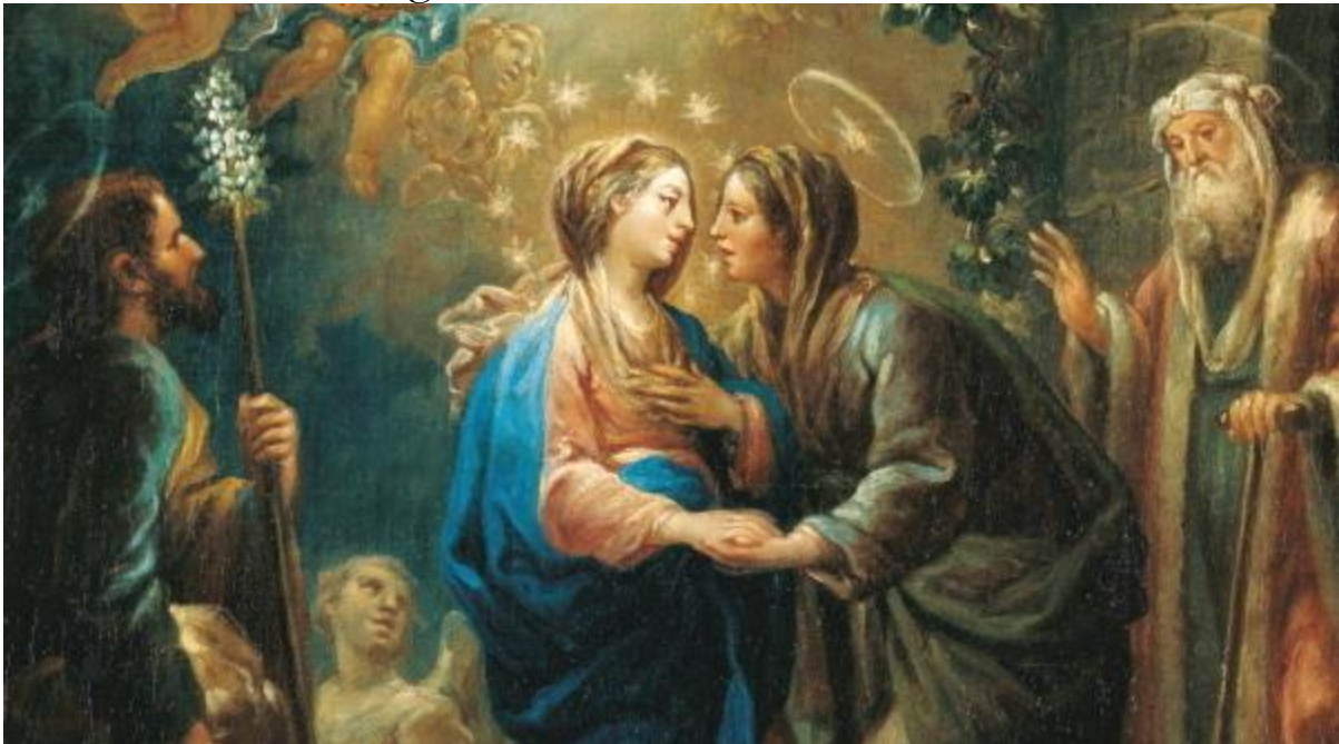
The Visitation , by Jerónimo Ezquerro, circa 1737